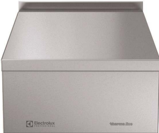
588564 (MBNABBEOOO) Closed Work Top, one-side operated with backsplash